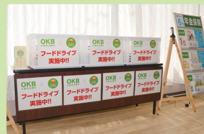
Site for collection of surplus food for food drive activity (OKB Consultation Plaza, Arai)

While meeting the true needs of regions in cooperation with local communities, the club actively carries out activities that contribute to society.