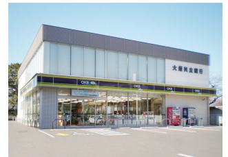
Handa Branch, aka Convenience Plaza Handa, planned by a trainee managing a convenience store