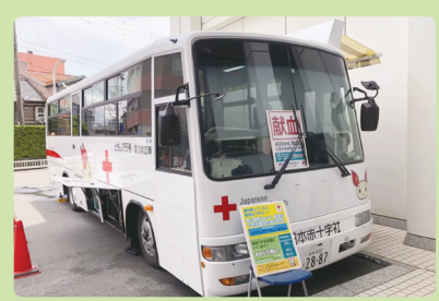
Blood donation drive for OKB Group executives and employees (at head office)

Ogaki Kyoritsu Bank launched its Social Contributions Committee in 1996. This panel revised its name to the OKB Social Contribution Club in April 2016. While meeting the true needs of regions in cooperation with local communities, the club actively carries out activities that contribute to society.